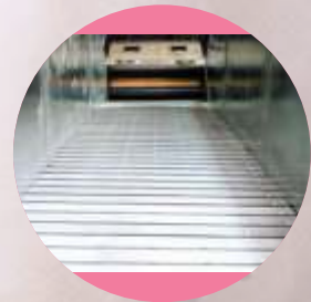
Internal View of Lint Slide For Humidification

“Quality is never an accident. It is the result of an intelligent effort. There must be a will to produce a superior thing.