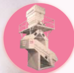
With Air Separator & Bypass