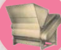
With Manual Feeding Hopper