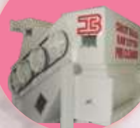
4 Cylinder Pull Through Type Pre Cleaner

“Quality is never an accident. It is the result of an intelligent effort. There must be a will to produce a superior thing.