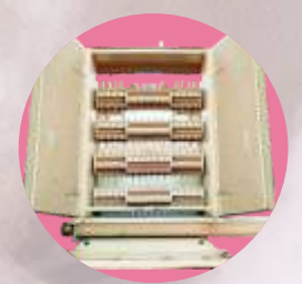
Trash Chamber with Roll, Jali & Screw Conveyor for Trash & Pink Boll worm removal