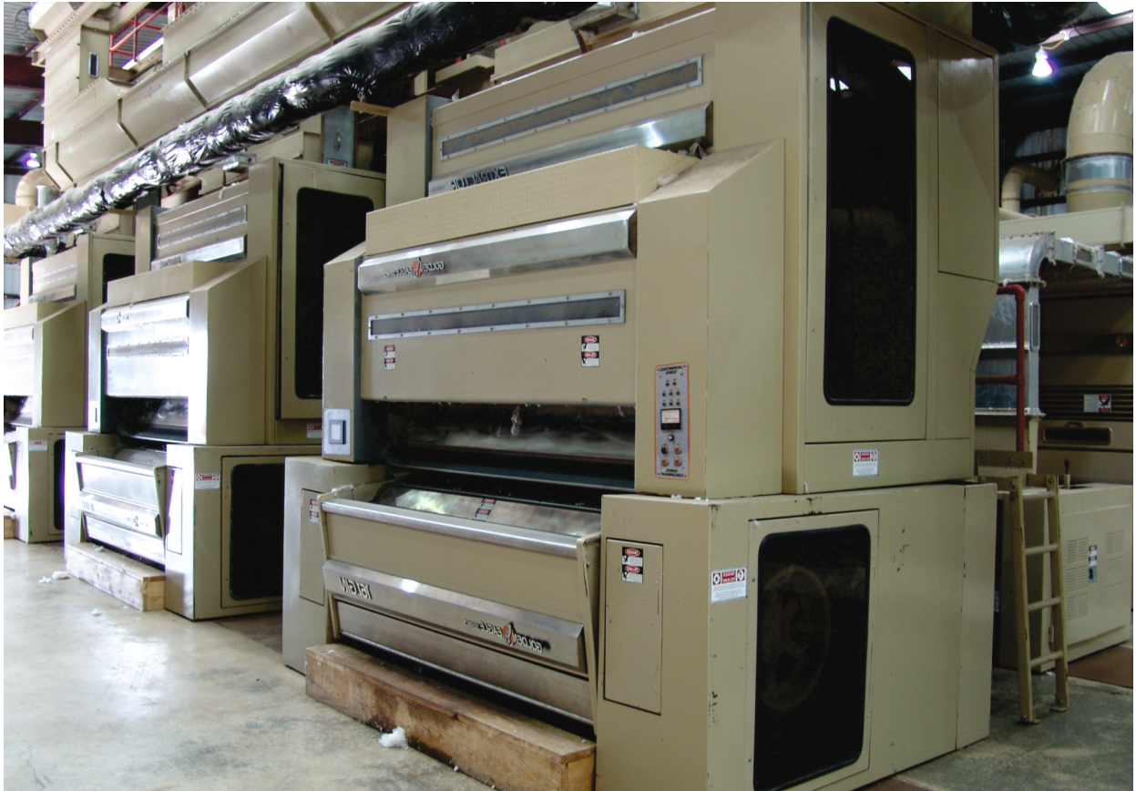
BAJAJ CONEAGLE Golden Eagle Feeder and BAJAJ CONEAGLE 161 Saw Gin