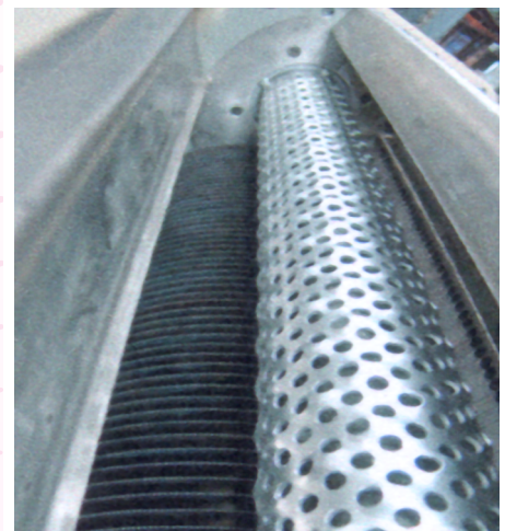
SEED ROLL CONVEYOR TUBE Seed is efficiently removed from the center of the seed roll.